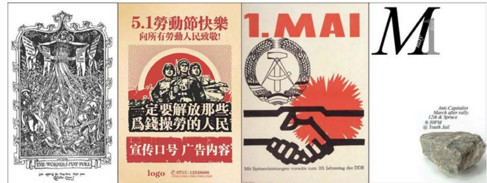
A few posters illustrating diverse ideologies competing to define the meaning of May Day.

On May 1, over 50,000 people attended an anti-war concert in Washington, DC organized in coordination with the May Day Tribe, a radical left formation including Yippie, gay, and feminist contingents. The